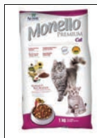
Dry Food for Kitten and Adult Cats Digestion and urinary tract (Jun. 2012)