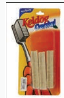
Oral Hygiene Range for Dogs Teeth and tartar prevention (Apr. 2008)