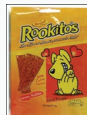
Chicken Snacks Flexible sachet, 65 g (Sep. 2007)