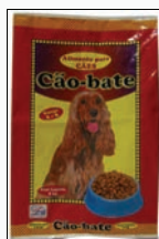
Dry Dog Food Flexible, 8000 g (Oct. 2009)