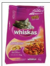
Prawn and Salmon Cat Food Flexible stand-up, 1000 g (Jan. 2008)