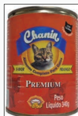
Cat Food Can, (only in 340g) (Mar. 2010)