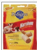
Calcium Enriched Snack Vitamin/mineral fortified (Mar. 2007)